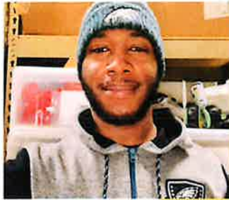
Dijon Battle Shipping and Receiving