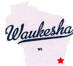
The City of Waukesha, WI